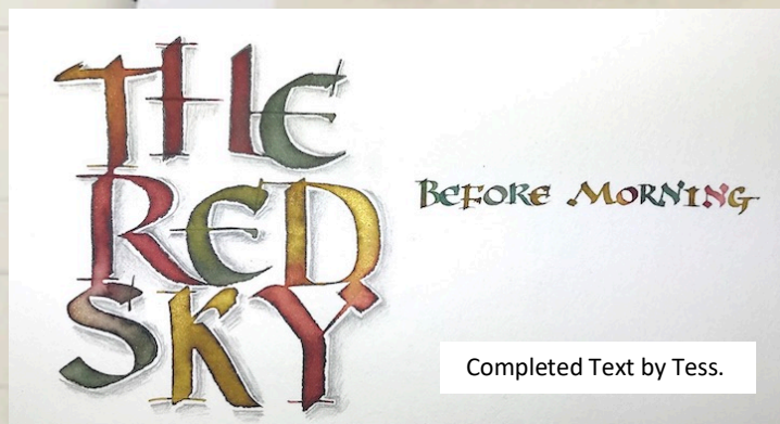
Completed Text by Tess.