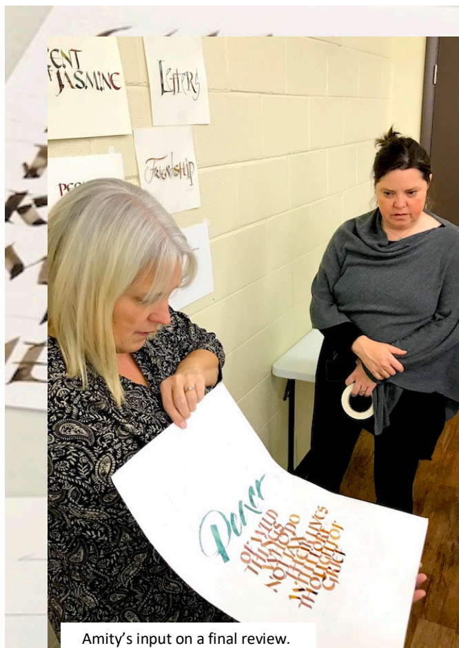
Amity's input on a final review.